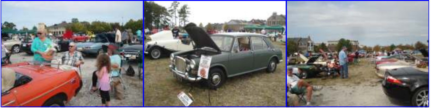
Scenes from the Grand Strand Car Show