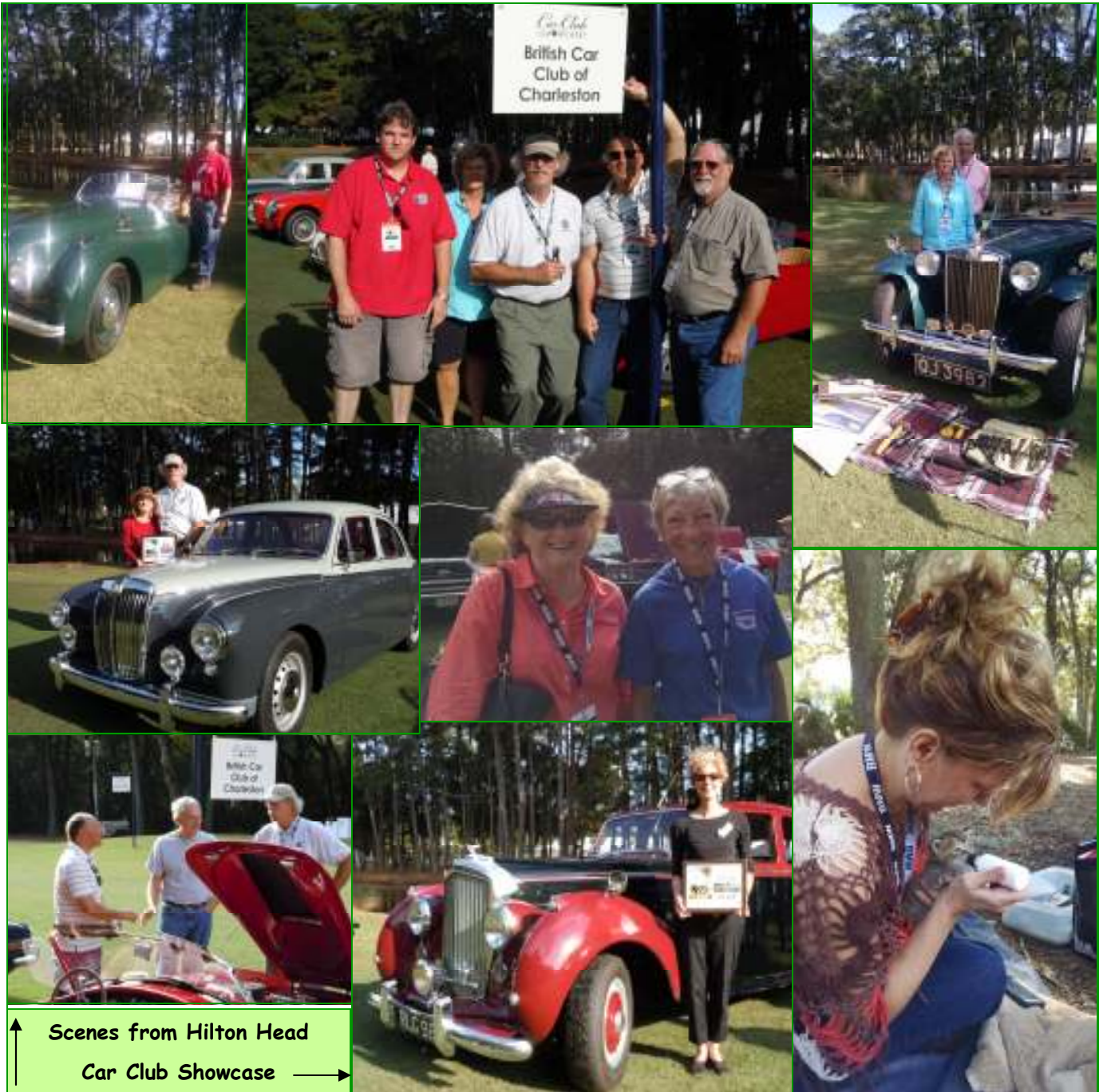
Scenes from Hilton Head Car Club Showcase